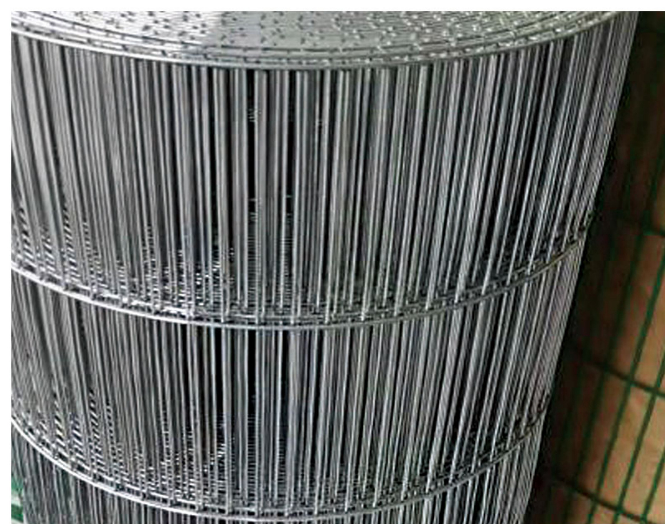
Rectangular hole 矩形孔