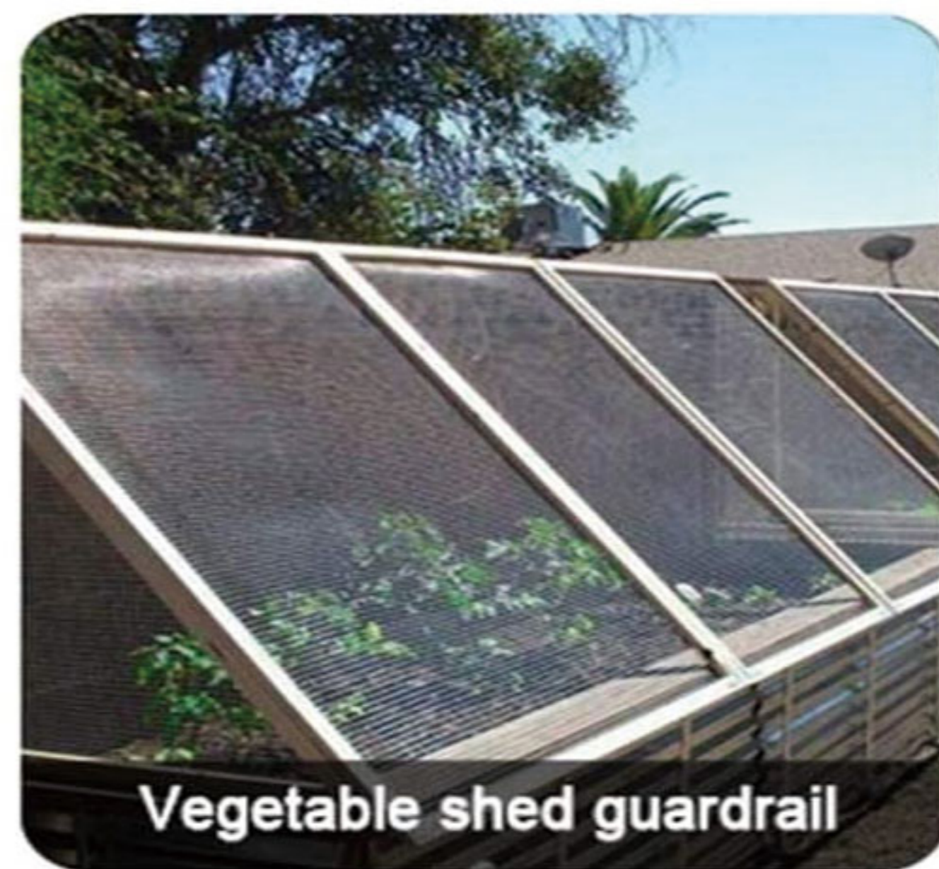
Vegetable shed guardrail