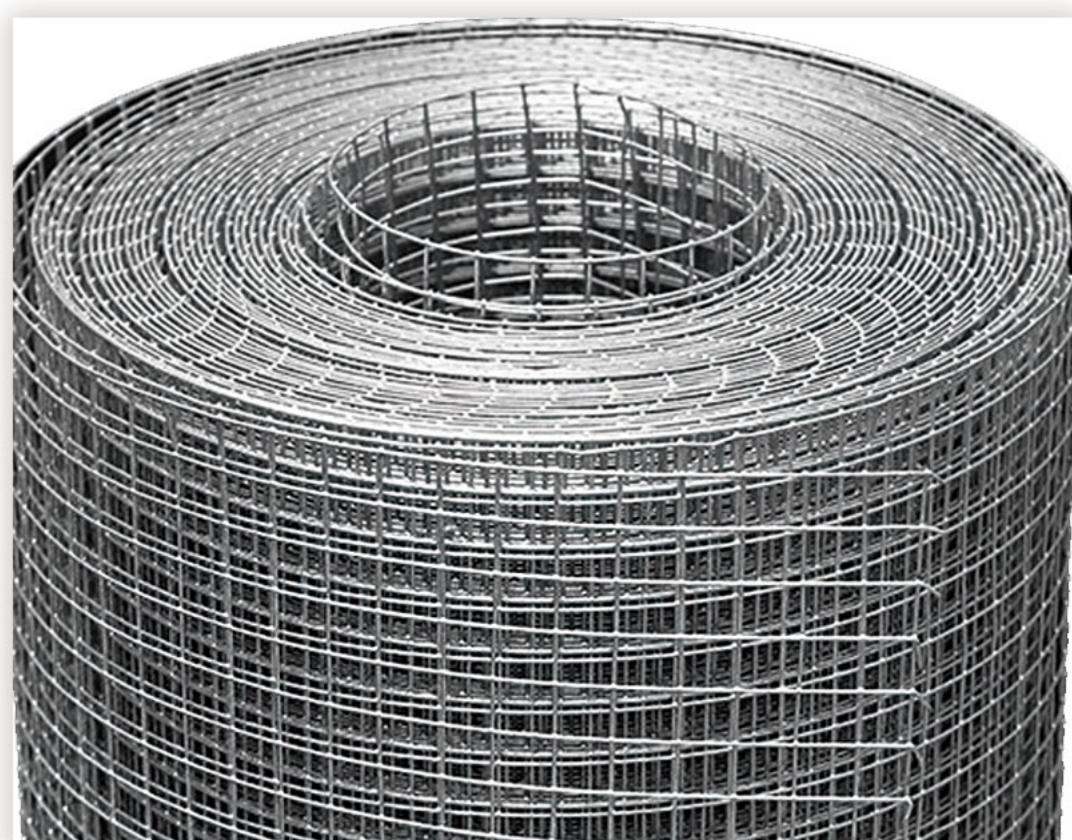
Square hole 方形孔